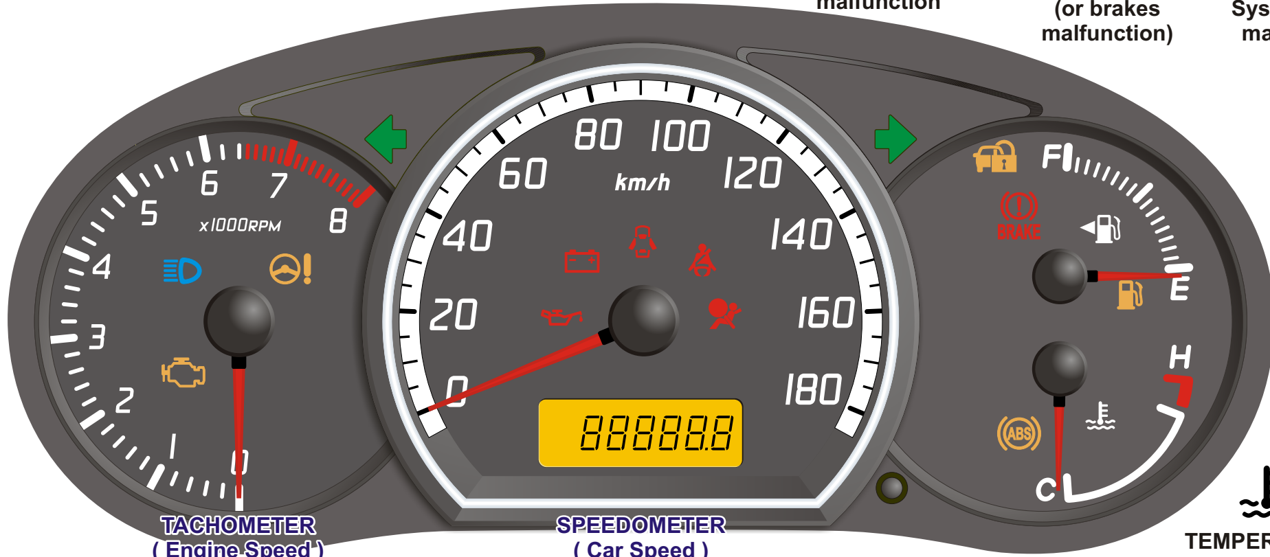
TACHOMETER ( Engine Speed )